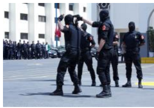
Urban Security / Crisis management