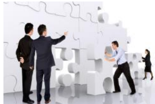
Council, Training, Insurance and Certification