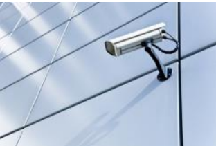
CCTV / Videoprotection