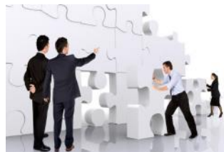
Council, Training, Insurance and Certification