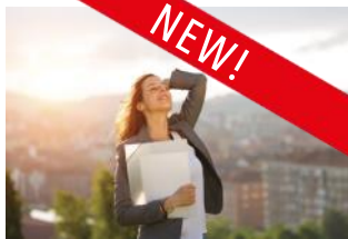
Wellbeing at work