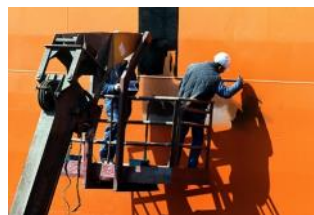
Construction site safety / Work at height