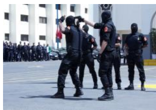
Urban Security / Crisis management